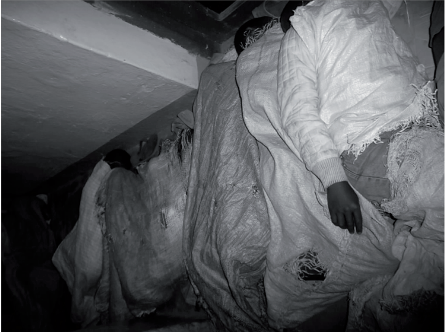
ELCT/NWD is ardently working to address the problem of children working and living on the street

Church leaders need to encourage their members to regard caring for orphans and vulnerable children as defending the quality of their discipleship.