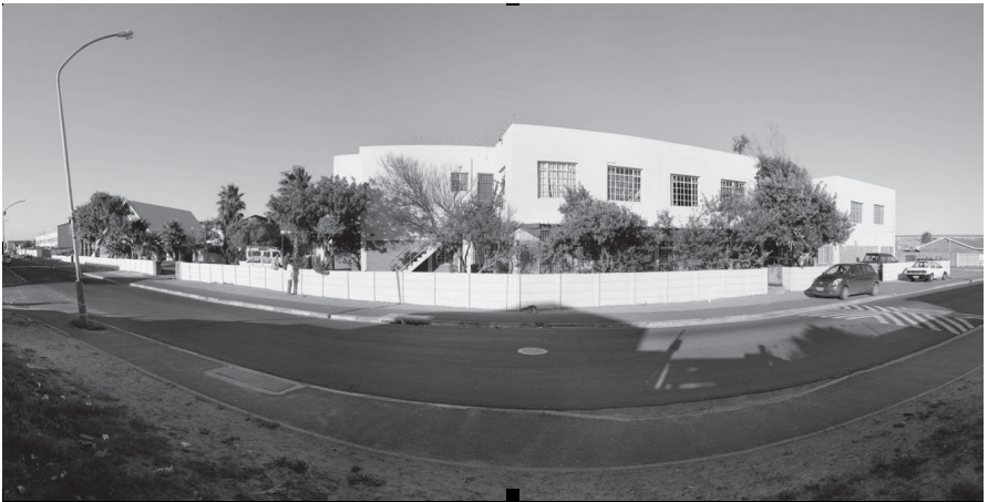
New World Foundation Community Development and Training Centre in Lavender Hill

NWF operates from its own community centre covering an area comprising the communities of Lavender Hill, St Montague Village, Hillview, Seawinds, Vrygrond/Capricorn (formal settlements) and Cuba Heights, Military Heights, Village Heights and Overcome Heights (informal settlements) in the so-called Cape Flats, near Cape Town.