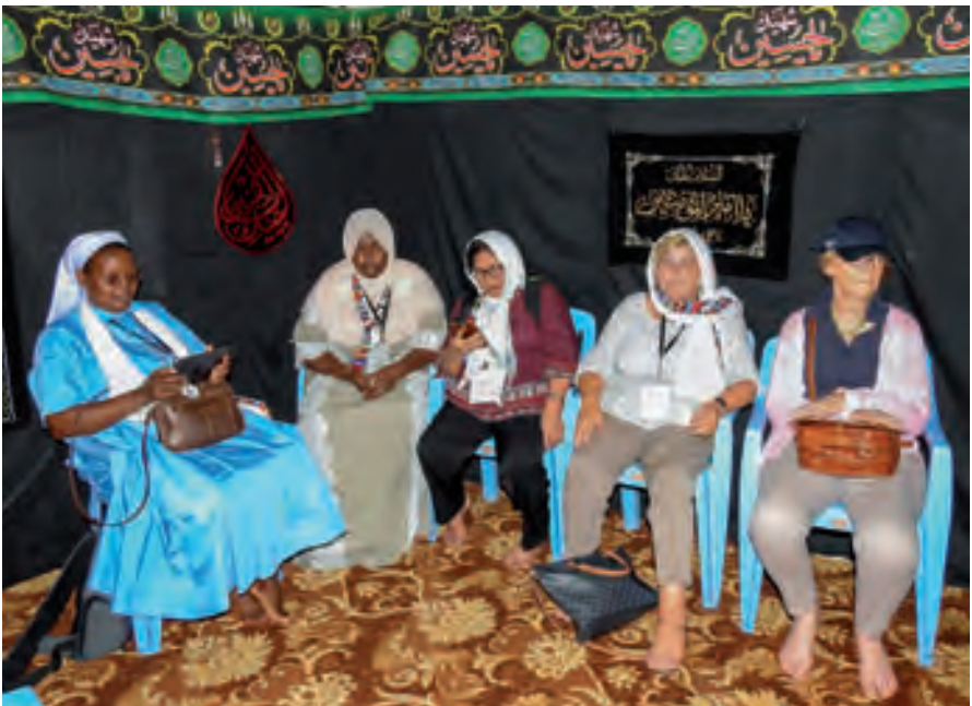
Exposure in Stone Town, Catholic Church (picture above) Exposure in Stone Town, Mosque