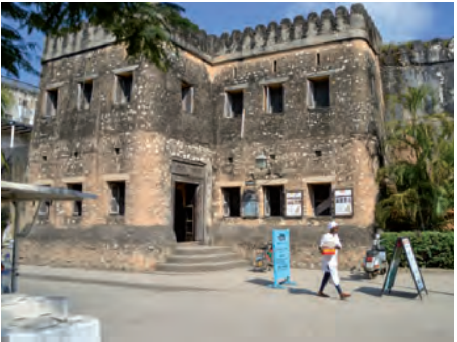
Zanzibar Old Fort