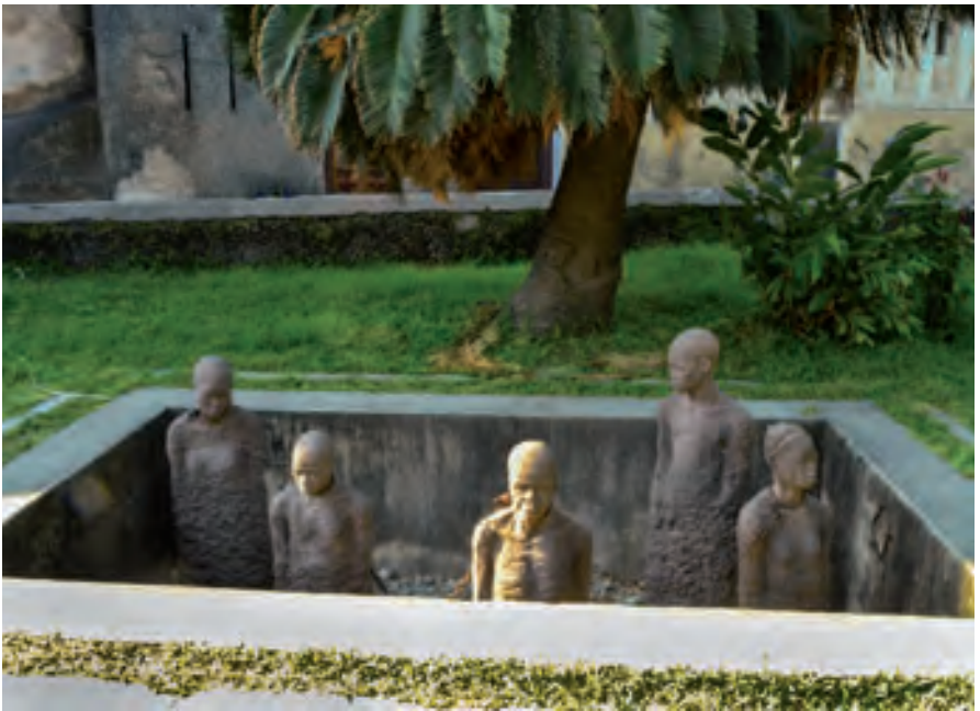
Old Slave Market in Mkunazini