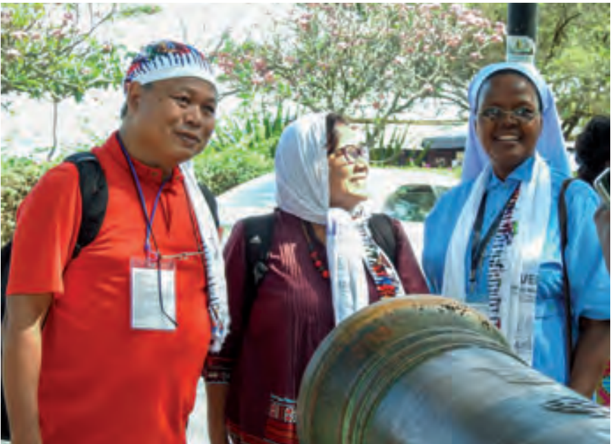
Exposure in Stone Town: ZANZIC Upendo Center (picture above) Exposure in Stone Town, Forodhani